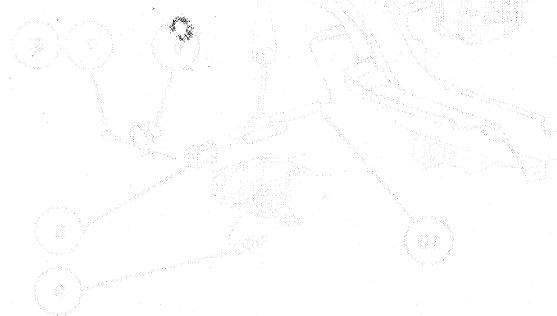
INSTALLATION STABILIZER BAR 04-02-4