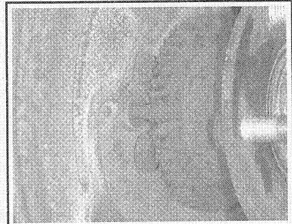
Fig. 88 When the head comes through the backing plate it mounts next to the exciter ring

2. Reattach the NGS Tester to the data link connector as though retrieving codes.